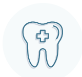
Dental & Vision Care